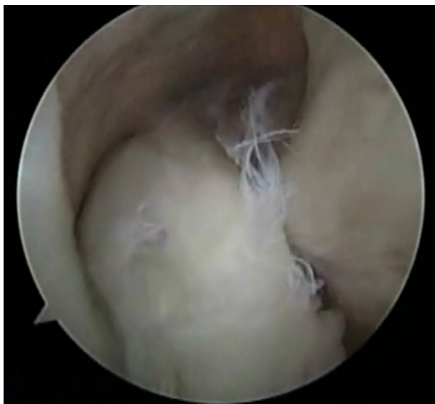
Figure 4 Visualization by arthroscopy one year after resection plasty for diffuse ACL mucoïd degeneration; the ACL has returned to its normal volume.

one knee had evidence of a partial tear (laxity difference of 2.4 mm, slope difference of 10 \mu/N ); three knees had evidence of a complete tear (difference of 3.4 mm, 3.5 mm and 3.8 mm, respectively, with the slope difference being above 12 \mu/N in all cases).