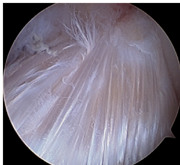
Figure 1 Arthroscopy view of ACL mucoïd degeneration in the left knee. The hypertrophied ACL fills the entire notch, the synovial membrane is missing, but the fibers are continuous.

All patients underwent a knee MRI to confirm the diagnosis; in six cases, the radiologist found a chronic ACL tear. Bone lesions were found in five cases: three with femoral condyle bone cysts on the axial face of the lateral condyle and two with tibial cysts under the intercondylar eminence. MRI sagittal slices were used to calculate the sagittal notch angle (SNA); frontal slices were used to calculate the ratio between the width of the ACL and width of the notch (Intercondylar Notch Index) [9].